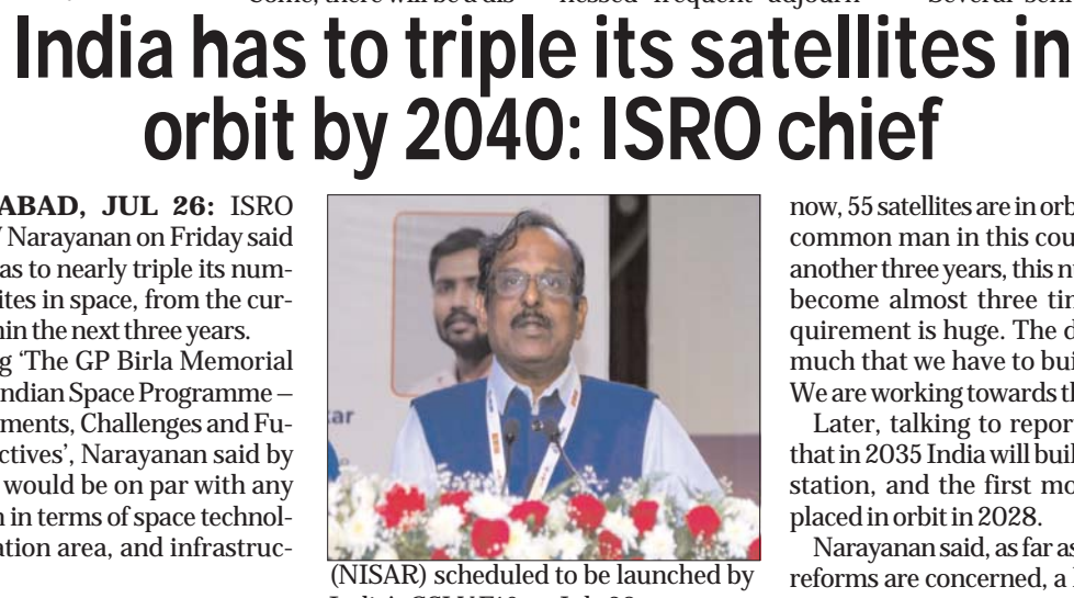
India's GSLV F16 on July 30

He also said as many as 12 launch vehicle missions are planned by the ISRO this year. The upcoming mission, NASA-ISRO Synthetic Aperture Radar